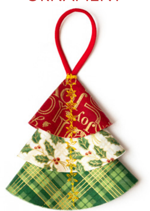
Finishes to about 4" × 4"